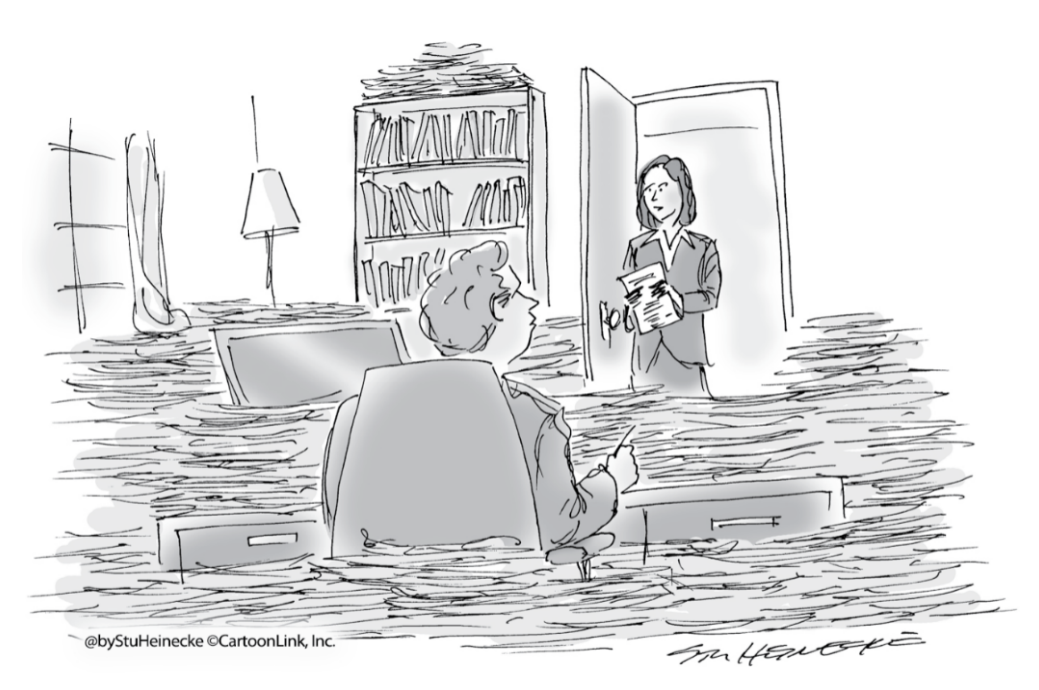
"Any room for another white paper?"